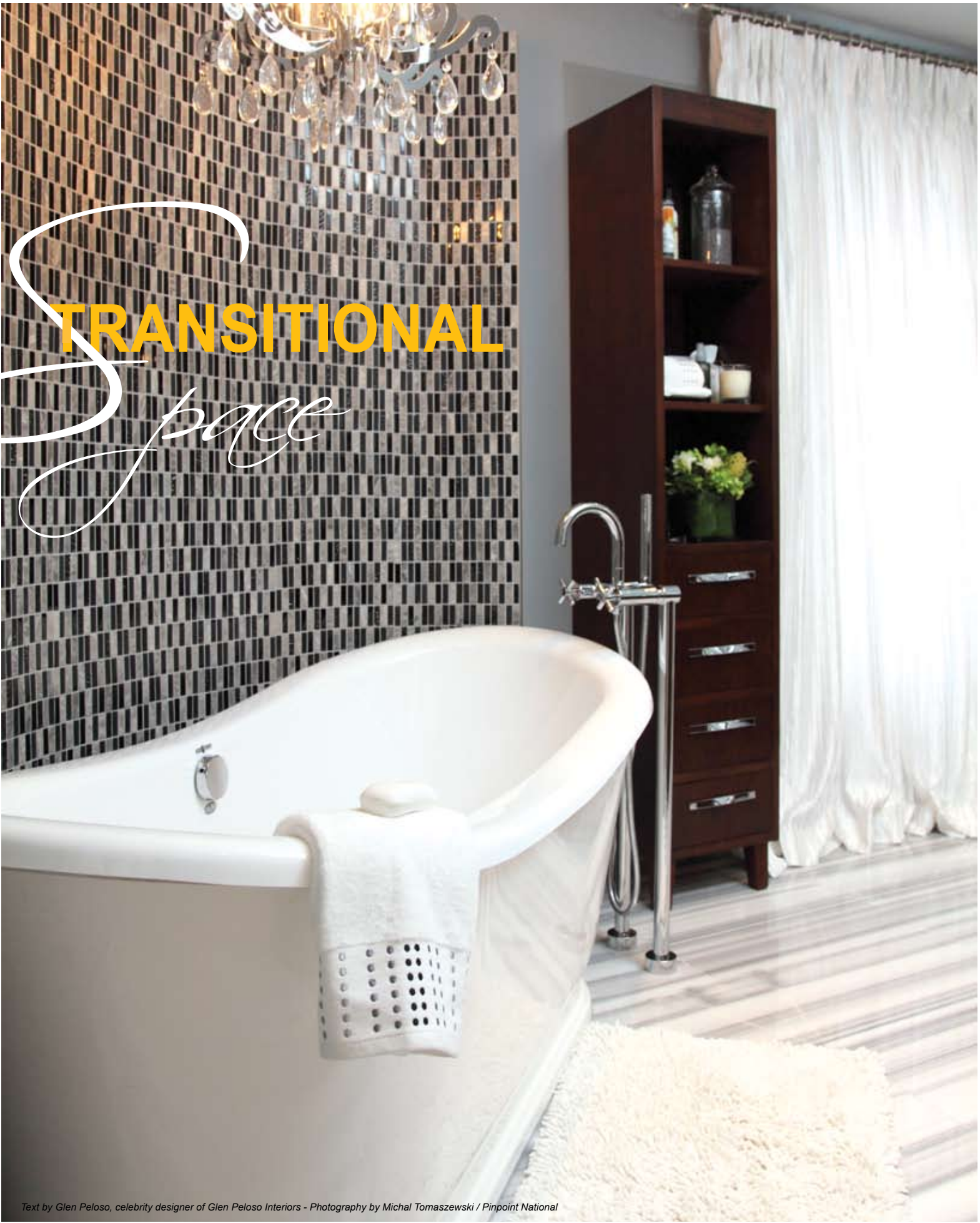
Text by Glen Peloso, celebrity designer of Glen Peloso Interiors