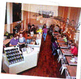
The atmosphere at Phil & Sebastian is relaxed and stylish.